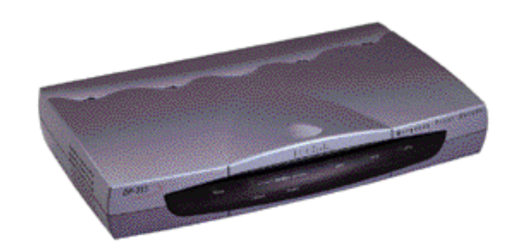
The D-Link DP-313 is an 802.11b compliant wireless print server with three parallel ports.

Aside from using IEEE 802.11b to provide 11Mbps LAN connectivity, the D-Link DP-313 implements DMA channel support for high-speed simultaneous printing on all three parallel ports. Multi-protocol support gives the D-Link DP-313 flexibility in mixed-LAN environments. The DP-313 utilizes PS Admin, a windows-based administrative program, for installation and setup. The DP-313 also supports the latest MIB-II (RFC-1213) for SNMP management. The DP-313 ships with an LPR software client for TCP/IP printing in Windows 95/98/ME. Finally, the DP-313 is capable of using DHCP, BOOTP, and RARPto obtain an IP address from the network.