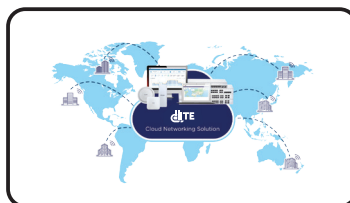
Unlimited Scalability Management Multi-Site Management