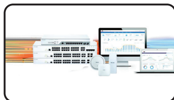
Easy-to-Configure APs and Switches