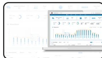
Management Intuitive Dashboard