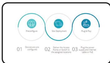
Easy & Rapid AP & Switch Deployment