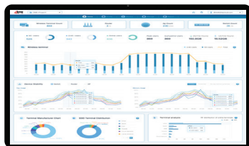
Intuitive Dashboard Interface

From the centralized interface, IT professionals and System Integrators can manage multi remote sites with features including creating accounts, generating reports*, and remotely installing, managing and monitoring the wireless and wired infrastructure for multiple users – all with minimal commitment in terms of training time, IT resources and capital.