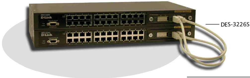
DES-3226S with 24 10/100Mbps ports. A DES-332GS stack module installed in the open slot provides a GBIC port and switch stacking capability.